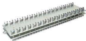
VM80-A Tube Holder Frame: 1.5ml Centrifuge x 64