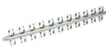
VM80-B Tube Holder Frame: 15ml Sharp Bottom Tube x 22