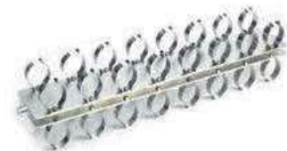
VM80-C Tube Holder Frame: 50ml Sharp Bottom Tube x 16